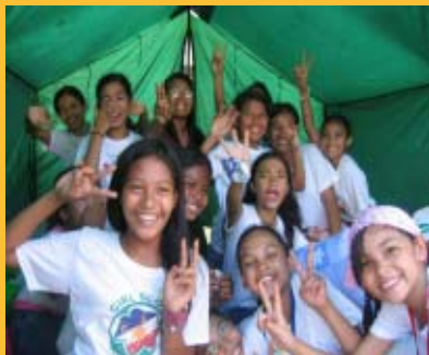
The first group to put up a tent poses for the camera.