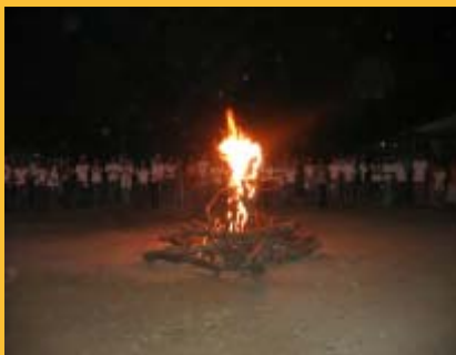
Students and teachers of CENTEX Manila and Batangas share the warmth of their bonfire.