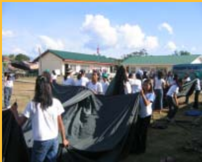
Grade 6 students from Manila and Batangas putting up tents for their camping.