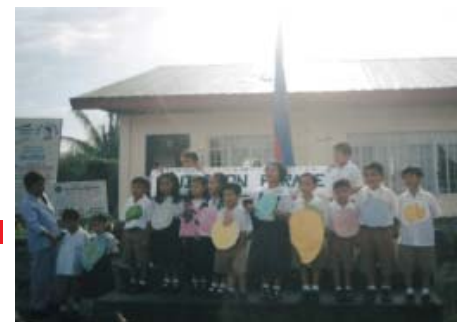
Kindergarten students performing in the new CENTEX Batangas stage.

Meanwhile, CENTEX pupils expressed gratitude to parents and teachers for providing them a place for their presentations. ■