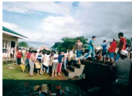
Parents working hand in hand in building the CENTEX Batangas Stage

T hrough the P T C A collaborative effort, CENTEX Batangas finally erected a stage last August 9. Over the past six years, s c h o o l performances were presented