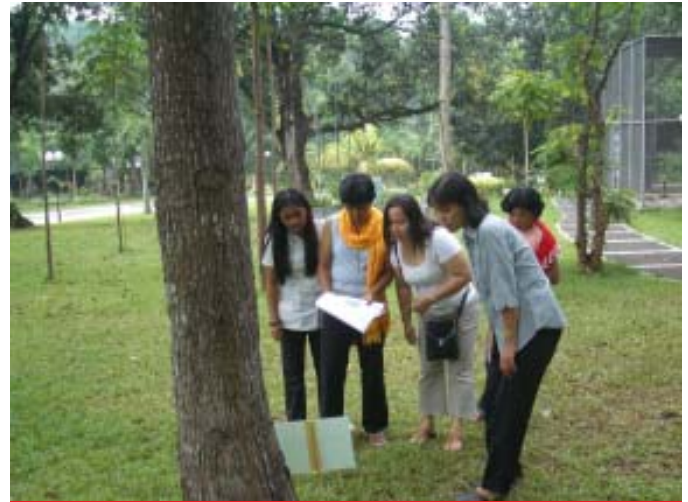
Teachers studying the evolution of life at the nature park.

Some of the participants have the following to say about this year's training: