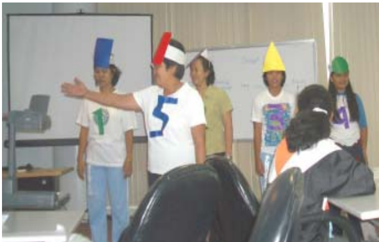
The latest addition to the CENTEX family, the AFP teachers, demonstrating a math lesson for pre-schoolers.

Truly, these teachers are once again ready to embark on their journey along the road to excellence! ■